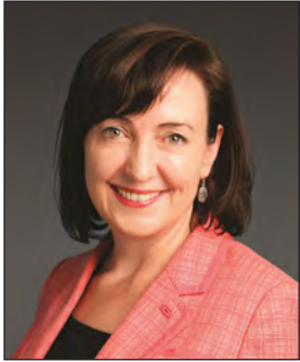
Minister for Education and Child Development Susan Close